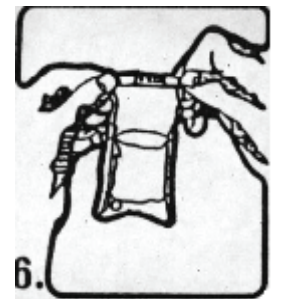
6. Turn tape wire inward on opposite face of fold.