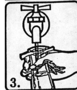
3. Fill bag to fill line.