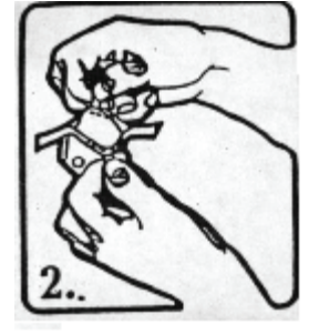
2.. Pull tabs outward to open bag.